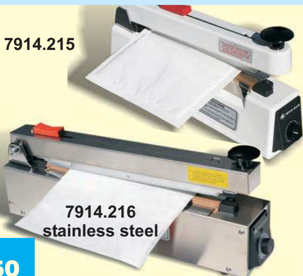
7914.216 stainless steel